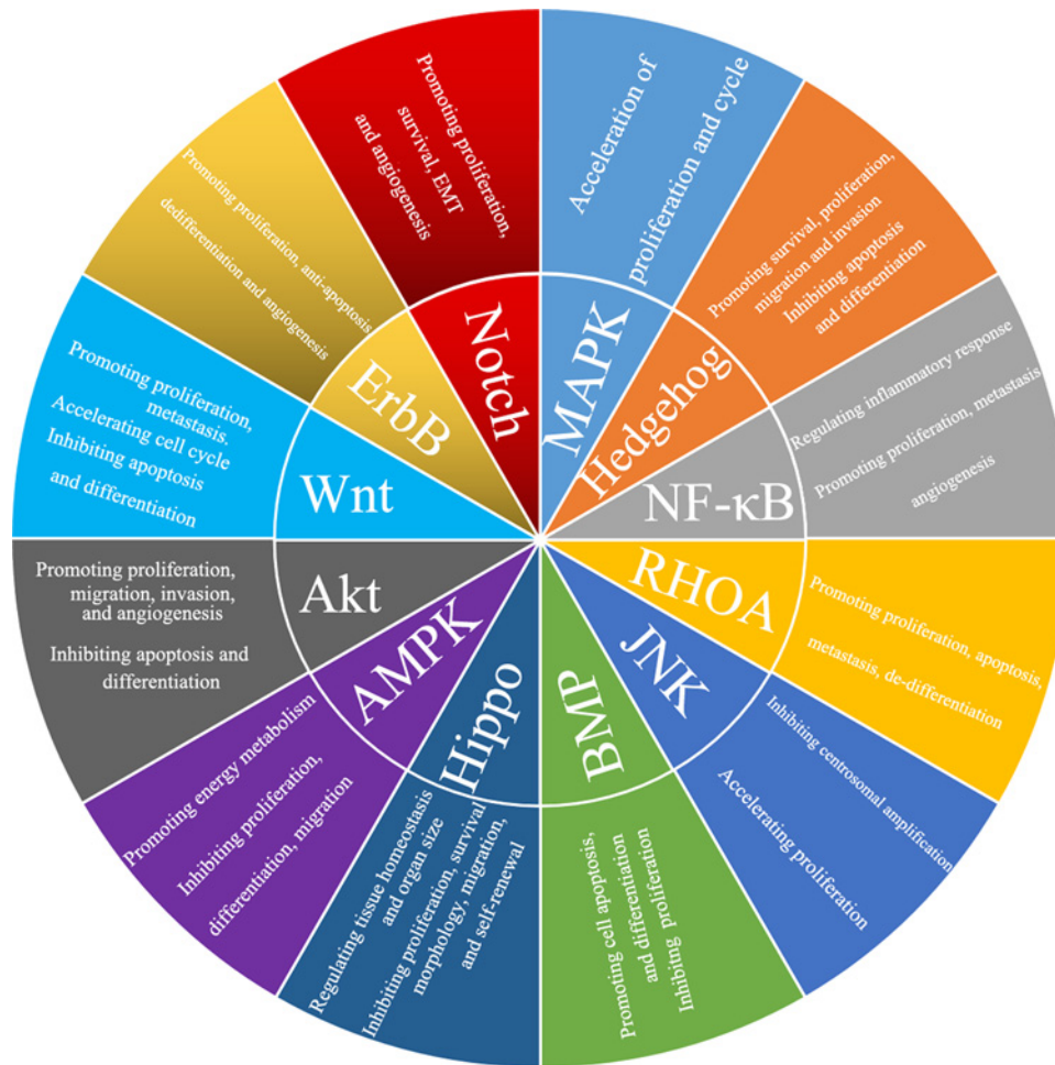
Figure 1. The function of these signaling pathways in CRC

Wnt, PI3K/Akt, Hedgehog, ErbB, Notch, NF- \kappa B and MAPK can promote the carcinogenesis of CRC. BMP, AMPK and Hippo can inhibit the development and progression of CRC. However, RHOA and JNK may play dual roles in CRC.