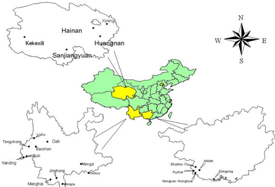
Fig. 1 Map of the key regions in China where field surveys were conducted

A survey was conducted in five border regions and 10 counties (but not in Simao, Lincang region or Wenshan prefecture). Extensive research was carried out through three separate routes: