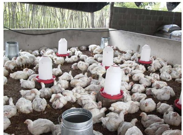
Fig. 3. Typical broiler pen, Isabela Island, Galápagos.