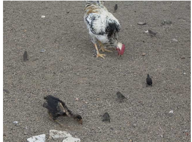
Fig. 2. Backyard chickens mingling with Darwin's ground finches ( Geospiza sp.) on Floreana Island, Galápagos.

In contrast, the numbers of domestic chickens are increasing in inhabited areas of the Galápagos. Domestic chickens are present on Santa Cruz, Isabela, San Cristobal, Floreana, and Baltra (Fig. 1). Three types of poultry farming are practiced on the Galápagos Islands: small-scale backyard meat chickens (1–40 birds per farm) (Fig. 2), small to medium-scale egg layers, and medium to relatively large-scale commercial broiler operations (2000–4000 birds) (Fig. 3). Currently, there are 23 broiler chicken farms on Santa Cruz, 6 on San Cristobal, and 4 on Isabela. In the past five to ten years, poultry production has intensified due to demand from the growing human population and tourist industry. Under Galápagos law, broiler chickens, brought to Galápagos at 1–5 days of age, must be unvaccinated and certified as healthy by approved aviculture facilities on the Ecuadorian mainland. Currently, no livestock vaccinations are permitted on the Galapagos Islands (David Cruz, SIC-GAL, personal communication). Feral populations of