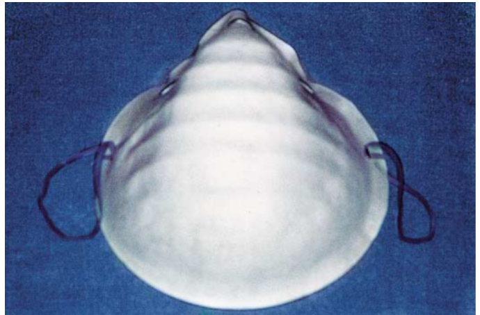
Figure 3. 1942 FB Fluid Resistant Molded Surgical Mask (marketed internationally as the Aseptex Fluid Resistant Molded Surgical Mask 1800) (3M ESPE SpA, Milan, Italy).