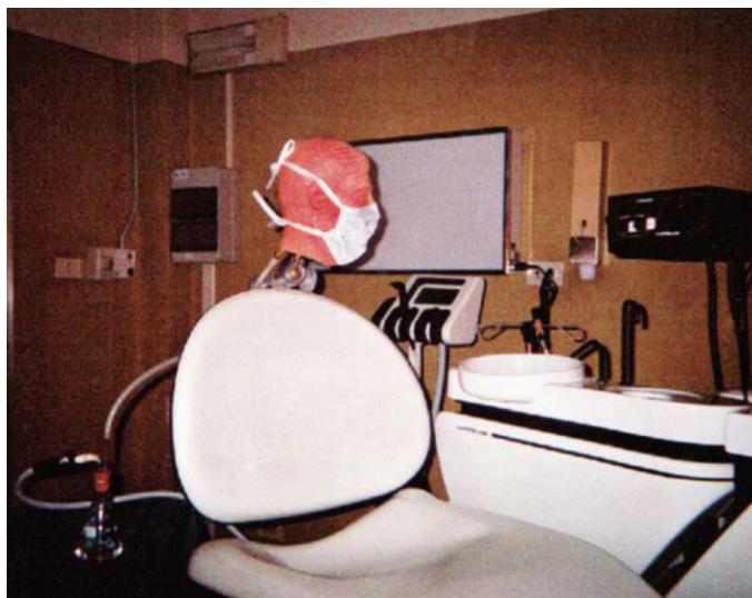
Figure 1. The experimental setting. Mannequin is shown with 1818 Tie-On Surgical Mask (3M ESPE SpA, Milan, Italy).

inorganic particulates, and also to protect the patient from possible contamination from the dental operator.