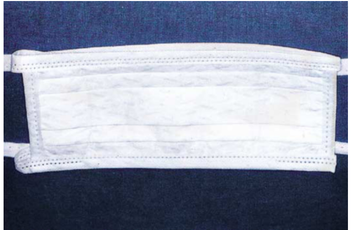
Figure 2. 1818 Tie-On Surgical Mask (3M ESPE SpA, Milan, Italy).

Table 1 reports the mean weight gains (that is, the difference between final and baseline weights, representing the amount of residual dry sediment deposited after runs) in the presence of each mask and with no mask under the various experimental conditions (that is, at airflow rates of 0.5 m 3 /hour and 9 m 3 /hour with and without vaporization). To confirm the validity of the experimental setup, we compared the weight gains recorded with and without vaporization of bicarbonate powder in the absence of any mask (control conditions): significant differences ( P < .05 with the Wilcoxon test) in weight gain were found at both airflow rates. To determine whether any measurable amount of