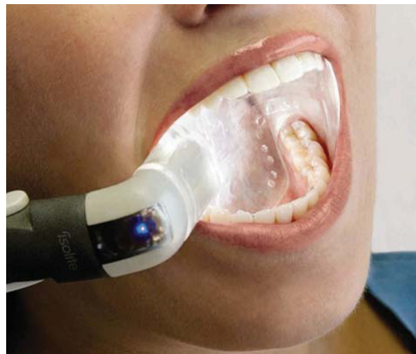
Figure 2. Placement of the Isolite system (Isolite Systems, Santa Barbara, Calif.) in the mouth, showing close adaptation to the oral soft tissues.