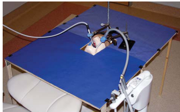
Figure 1. Overview of the experimental design setup.

To achieve a power of 0.80 (effect size = 0.20; P < .05 ), 24 trials in each group were necessary. Therefore, we conducted eight trials for each of the three teeth tested in each group (that is, the control and two experimental groups). This resulted in a total of 72 trials for the experiment. Two graders (M.C.H., J.M.L.) each scored 36 trials. To analyze the data, we conducted a two-way analysis of variance (ANOVA) with the use of statistical software (PASW statistics 18.0.0, IBM, Armonk, N.Y.). The results of the ANOVA indicated both significant main effects