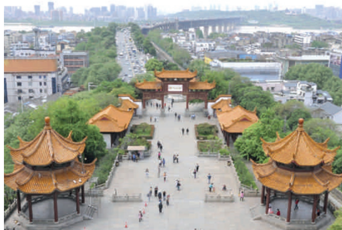
Wuhan has more undergraduate and graduate students than anywhere else in the world.

As a CAS institute, WIV’s strength lies in basic research, but it has also been collaborating with universities, hospitals, the Chinese Centre for Disease Control and start-up pharmaceutical companies to conduct multi-disciplinary research