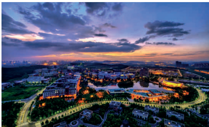
Part of the Optics Valley called Biolake.

Huazhong Agricultural University (HZAU) traditional strength is in agricultural research and has become