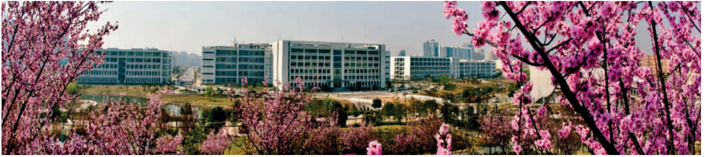
WUHAN UNIVERSITY OF TECHNOLOGY