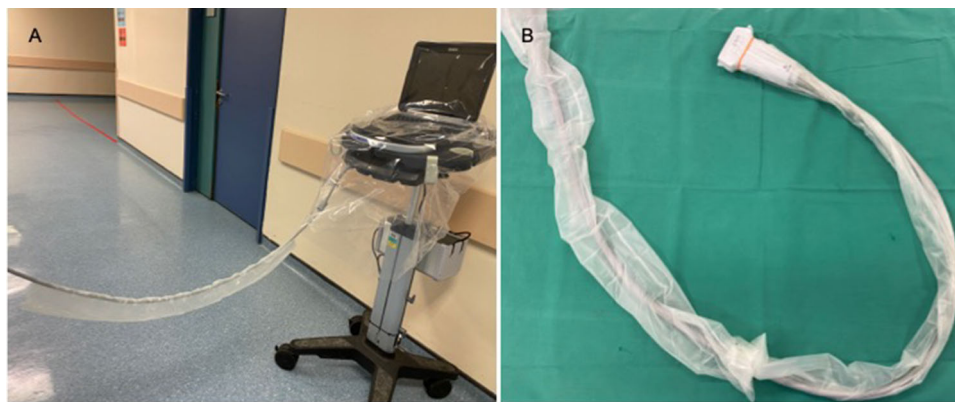
Fig. 2 The ultrasound probe is covered with a disposable sheath along its entire length so that any part of the probe that potentially may come in contact with the patient is protected. Depending on the type of sheath available, it may need to be extended with the use of more than one sheath. A) For example, the probe sheath in our

institution is too short to cover the entire length of the probe, so we cut off one end of a sheath to form a tube and slide it over the probe to cover the proximal half, and then B) use another (sterile) sheath to cover the distal half.