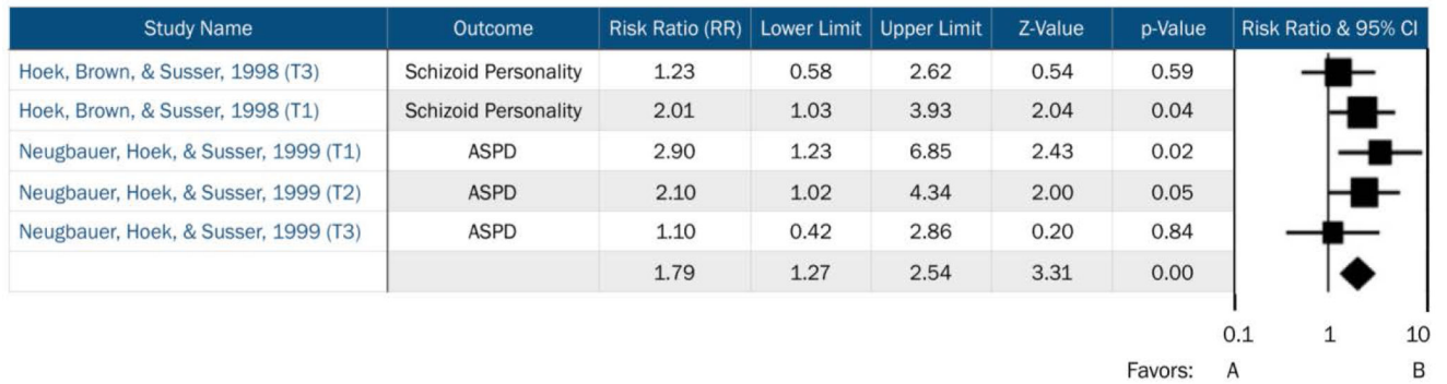
Figure 4: Forest plot of all studies in the personality disorders domain. T1=Trimester 1, T2=Trimester 2, T3=Trimester 3. Favors A=negative association between prenatal famine exposure and personality disorders in adulthood. Favors B=positive association between prenatal famine exposure and personality disorders in adulthood.