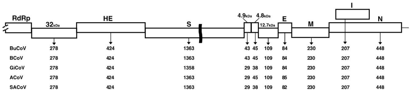
Fig. 2. Schematic comparison of the genomes (3’ end) of different ruminant CoVs. RdRp, RNA dependent-RNA polymerase. Below the diagram, the length in amino acids is reported for the encoded proteins of bubaline coronavirus 179/07-11 (BuCoV), bovine coronavirus Mebus (BCoV), giraffe coronavirus US/OH3/2003 (GiCoV), alpaca coronavirus (ACoV) and sable antelope coronavirus US/OH1/2003 (SACoV).

A 9.6-kb region encompassing the entire 3’ end of the viral genome (from the 32-kDa to nucleocapsid protein genes) was determined through PCR amplification and subsequent sequencing of overlapping fragments. At the 3’ end of viral RNA, bubaline CoV strain 179/07-11 had the same genomic organization of other ruminant CoVs (Fig. 2). Nine ORFs were identified by both ORF Finder program and sequence comparison with reference ruminant CoV sequences. All predicted ORFs but the 4.8-kDa gene were preceded by a repeated intergenic sequence, CUA AAC or CCA AAC, which is predicted to interact with the