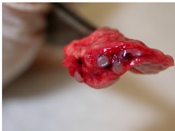
Figure 6. Cut surface of the lung from Fig 5.

In 2005, a distributor for a major pet store chain began importing ferrets from a single source, a change from the largest US breeder. Many of these ferrets from this new animal source have exhibited chronic conjunctivitis, sneezing, wheezing, and coughing. Conventional diagnostic testing has not provided a definitive diagnosis for this disease condition. Diagnostic tests used to test affected ferrets included bronchiolar lavage (e.g., cytology, aerobic, anaerobic culture), radiographs, endoscopy, heartworm antigen detection, echocardiography, and na-