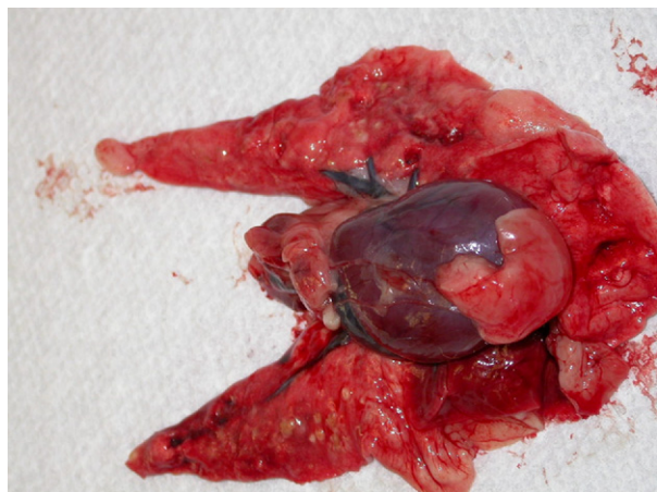
Figure 5. Lungs and heart of the index pathology case.

trol opportunistic bacterial infections), and a ferret “critical care” diet can be used to keep the ferret comfortable while the ulcers heal. Stress and immunosuppression appear to play a significant role in the development of oral ulcers.