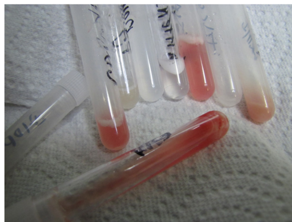
Figure 7. Bronchiolar lavage samples from Mycoplasma sp. suspect ferrets.

Bronchiolar lavage samples and conjunctival swabs were submitted to Dr. Matti Kiupel at Michi-