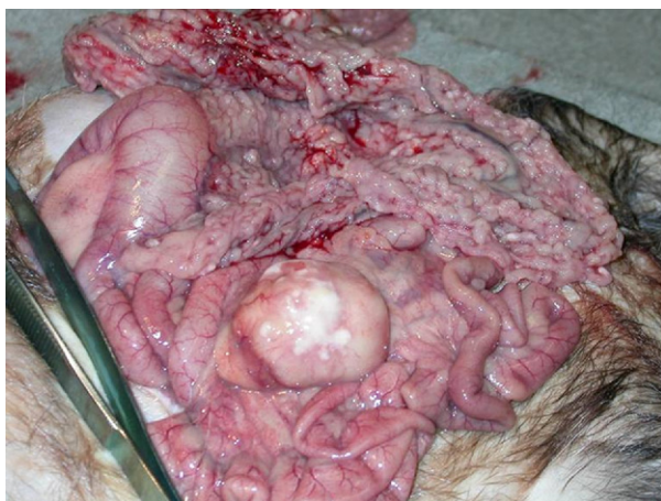
Figure 1. Gross findings of ferret diagnosed with FSCV.

Histologic lesions have been detected in the mesentery/peritoneum, lymph nodes, spleen, kidneys, liver, lung, intestine, pancreas, stomach, brain, and adrenal glands. Other notable lesions include a non-suppurative meningoencephalitis and suppurative or nonsuppurative tubulointerstitial nephritis. 1 Coronavirus antigen has been detected in all tissues with lesions; however, the staining reaction was most prominent in lymph nodes, splenic lymphoid follicles, and all