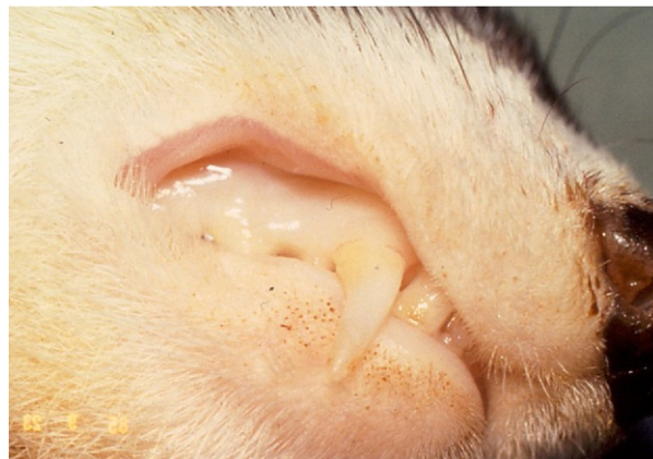
Figure 2. Pale mucus membranes seen with severe anemia.

At this time, the underlying etiology of DIM is unknown. No pathogen has been isolated in any of