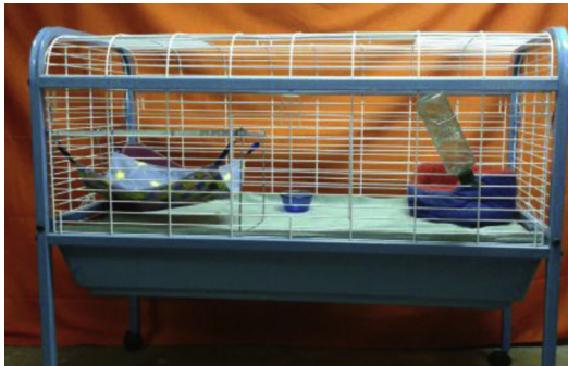
Fig. 2. Example of indoor housing for older, less active ferrets.