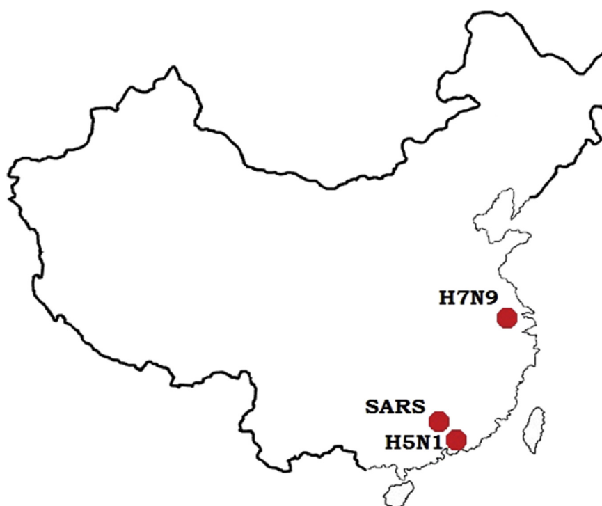
Fig. 1 Likely origins of the H5N1, SARS and H7N9 viruses [2,35,45].

acquired via close and high-risk contact with birds, H7N9 appears to be often acquired via only incidental contact [50]. For unknown reasons, whilst H7N9 avian influenza has mainly affected older individuals, especially those over 60 years of age [39,40,43], H5N1 avian influenza has more often affected younger individuals [43,51], especially those under 18 years of age [52]. Therefore, VFR travellers at the extremes of age should be especially cautious in the event of avian influenza outbreaks.