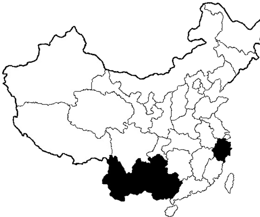
Fig. 4 The four provinces where most typhoid cases occur [76].

is no vaccine, prevention is by mosquito avoidance and vector management [75].