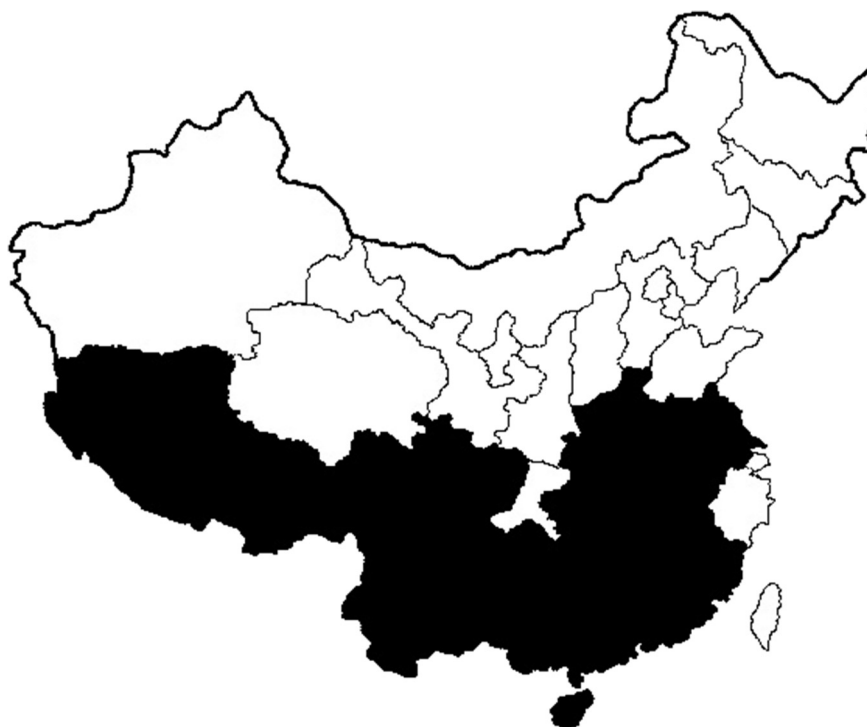
Fig. 2 Provinces where malaria has been reported [70]. Note that only certain rural areas are affected in each province.

avoidance measures alone are recommended for travellers to all other malarious areas [72].