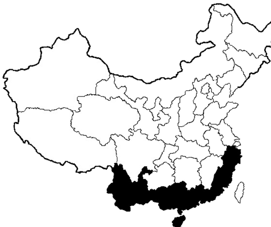
Fig. 3 The provinces where dengue fever has been reported [74].

[74]. As the vector is also present in other provinces, there is the potential for further spread [75]. In the past three decades, there have been more than 650,000 reported cases nationwide, with at least 610 deaths [74]. Dengue outbreaks now occur frequently in southern China, often as a result of the virus being introduced by travellers returning from Southeast Asia where dengue is endemic [75]. As there