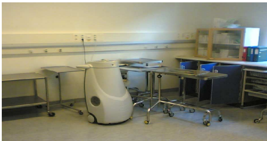
Figure 1 Decontamination of rooms and equipment with a hydrogen peroxide aerosol, using a pre-programmed robot.

One test room of 40 m 3 was closed and openings were taped over to control the concentration of the aerosol. The H 2 O 2 concentration was programmed according to the volume of the room. Three pre-set cycles of H 2 O 2 dry aerosol were performed. Each time, the diffusion time was 12 min, giving a concentration of 12 ppm, followed by increasing contact times of 30, 60 and 120 min.