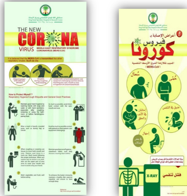
Fig 2. Education posters/rollups.