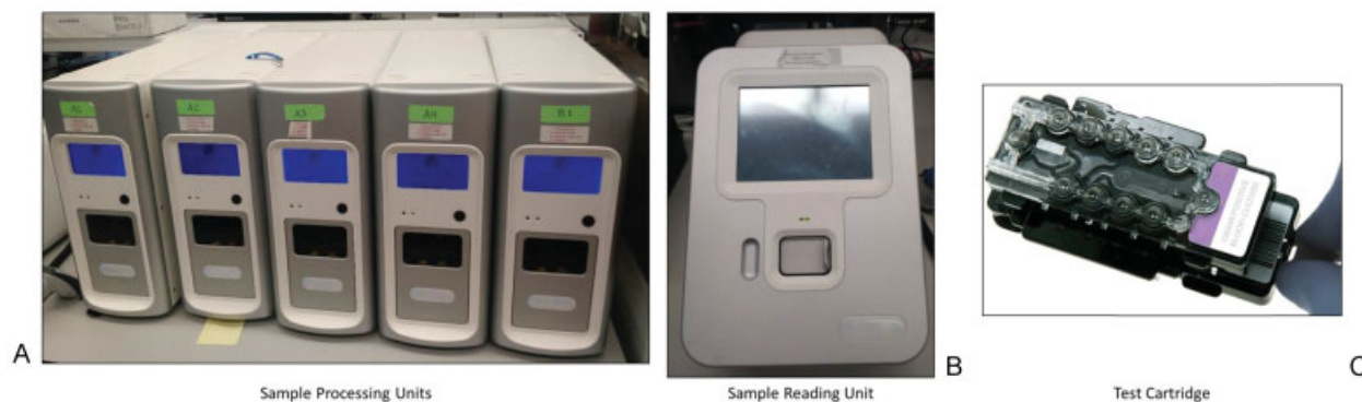
Fig. 3 The Nanosphere Verigene System, consisting of instrumentation (A, B) and the test cartridge (C). Sample and reagents are added to the processing unit. After analysis is completed, the cartridge is moved briefly to the reading unit for interpretation.

complementarily bind to specific target ribosomal RNA sequences of bacteria, yeasts, or other microorganisms. Target sequences are naturally present in bacteria at a concentration high enough to enable visual detection of the specific fluorescent signal. 72 FISH can be used to detect pathogens that are difficult or time consuming to identify with traditional culture methods, especially when more than one species is present in the sample, as in the case of polymicrobial infections including VAP. RespiFISH HAP Gram (–) Panel (miacom diagnostics GmbH, Duesseldorf, Germany) is a classic FISH technology employing fluorescently labeled DNA molecular beacon probes to develop a simple procedure known as the beacon-based FISH technology. 73 This panel is able to detect most gram-negative bacterial pathogens and has been shown to be accurate in detecting the causative pathogens in patients with pneumonia, including VAP. 74