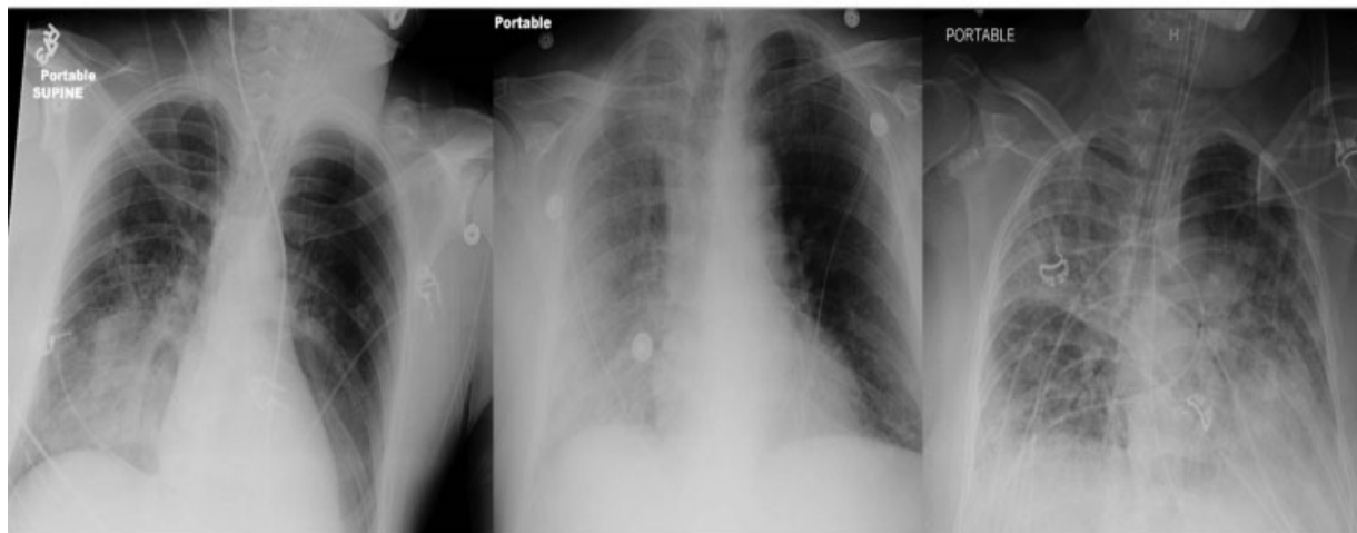
Influenza A and MRSA