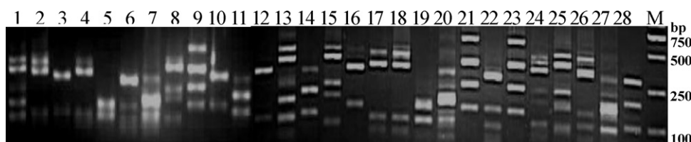
Fig. 2. Fingerprint analysis of the scFv phage clones by the frequent-cutting enzyme Bst NI. Lane 1–25: The restriction patterns of each scFv clone; Lane M: DNA Marker DL2000.

As a basic functional unit of the antibody, the single-chain fragment variable (scFv) region maintains antigen specificity, and has a wide range of biomedical applications (Intorasoot et al., 2007; Bhatia et al., 2010). The phage library in which the scFv gene repertoires are expressed on the surface of phages becomes a powerful tool for isolation and identification of scFv molecules of interest (Cabezas et al., 2008; Tang et al., 2009). Here we describe a simple and rapid method for the generation and evaluation of a murine scFv library specific for porcine aminopeptidase N (pAPN), a common cellular receptor for TGEV and PEDV, using the T7Select Phage Display System. Compared with other similar technologies, the