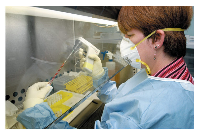
Challenging: The occurrence of a new respiratory disease (Sars) puts immediate and substantial pressure on researchers to discover the cause and develop strategies to combat it.

future health problems will be very important," he said.