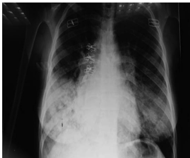
Figure 3 Chest X ray of 38 year female with severe CAP.

are bilateral ground glass opacity and alveolar consolidation [18]. Striking characteristic of S. pneumoniae is its tendency to involve the pleura, parapneumonic effusions are common in Pneumococcal pneumonia [19]. In the study conducted by Ali Khawaja et al. [20] they found that the most common chest X ray finding in patient with CAP was lobar consolidation in (63%) followed by pleural effusion in (37%) and interstitial infiltrates in (28%). In another study by Seksan et al. [21] they found that the most common pulmonary infiltration pattern of X-ray in patients with CAP was patchy infiltrates in (69.3%), followed by interstitial infiltrations in (22.2%), diffuse alveolar infiltrations in (5.0%) and multilobar infiltrations in (3.5%).