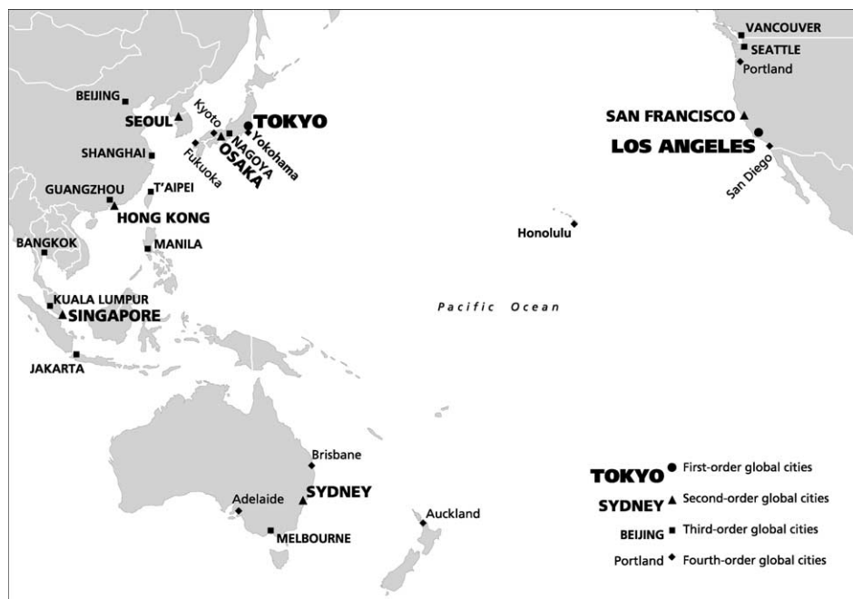
Fig. 1. Global cities with the Asia-Pacific.

This city-centred growth pattern is complemented by complex and distinctive forms of regional development, which include (1) multi-centred urban growth corridors or ‘megalopolitan’ regions, such as the classic New York–New Jersey conurbation (Gottmann, 1961), and the Randstat urban corridor in the old Atlantic core, and the example of the ‘extended metropolitan regions’ (McGee, 1990) of East Asia and Southeast Asia, such as Jakarta–Bandung, Beijing–Tianjin, and Tokyo–Kawasaki–Yokohama,