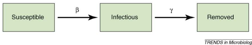
Figure 1. Typical compartmental model of epidemiological theory.

This overlap permits application of the broader tenets of evolutionary ecological theory to infectious diseases, and, more specifically, can guide the investigation of disease emergence.