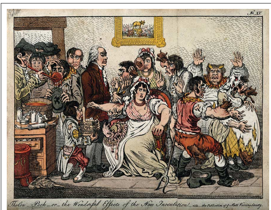
Thou'ldst Pock... on the Wonderful Effects of the New Inoculation!... with the publication of the Anti-Vaccine Society.