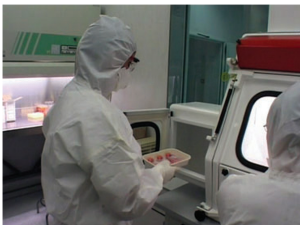
FIG. 1. Working with a class-III biosafety cabinet.

Serology diagnostics for RG-4 agents is the area that presents the greatest difficulties, essentially due to the fact that there are currently very few commercially available diagnostic tests for these pathogens, whose identification relies almost completely on the use of in-house reagents that need to be newly produced, and constantly verified and validated [48–53]; indeed, the validation of these homemade