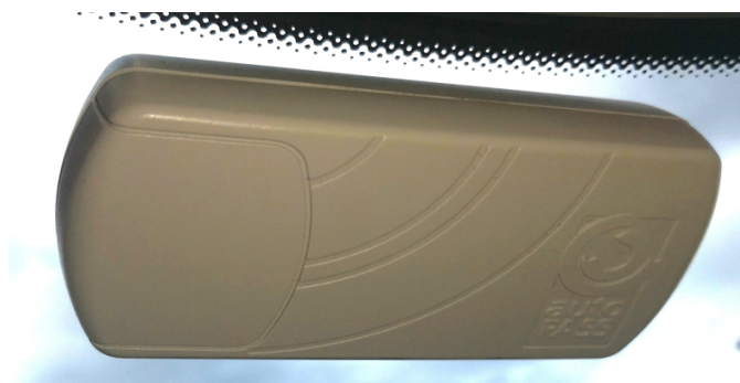
Figure 1. Active RFID tag for vehicle identification and automatic toll payments in Norway

The rest of this paper is organized as follows. Section 2 presents an overview of the research methodology applied in this research. Section 3 provides an overview of the main themes and findings. A discussion of the main findings is presented in section 4, and finally, a conclusion and recommendations for future research avenues are presented in section 5.