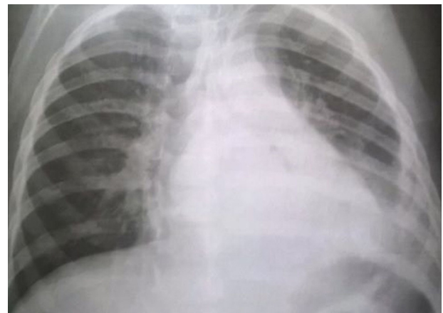
Fig. 1 – X-ray reveals an acute respiratory distress syndrome (ARDS).

to the admission, which was managed with plasma, albumin and furosemide administration. She had a favorable outcome, and was discharged eight days after the admission. Microbiological investigation was negative for bacteria on blood and respiratory secretion. Respiratory viruses were surveyed in nasopharyngeal aspirates (NPA) using a PCR multiplex method (RV 15, Seegene ® , South Korea), which detects respiratory syncytial virus A and B, adenovirus, influenza A and B, parainfluenza 1, 2, 3 and 4, human metapneumovirus, coronavirus OC43 and 229, human rhinovirus A, B and C that resulted negative. By molecular methods a conventional RT-PCR, to the 5'NCR as a target, was performed in NPA and detected HPeV, which was confirmed by nucleotide sequence method (Fig. 2). 1 To our knowledge, this is the first report of HPeV circulation in south Brazil. Currently, 16 types of HPeV are recognized and reported mainly in patients under five years old. HPeV have a worldwide distribution and have been reported in many clinical conditions such as gastroenteritis, respiratory infections, neonatal sepsis, various and severe CNS diseases, including