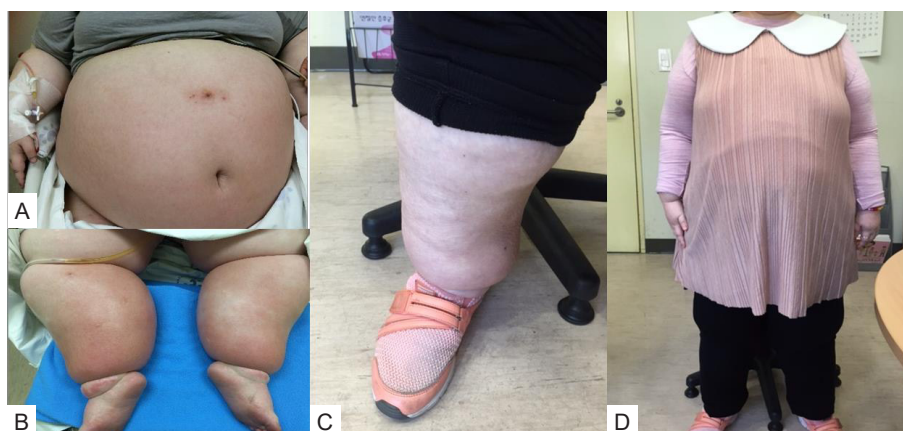
Fig. 1. Clinical photographs of the patient at her first visit (A, B) and 1 year after discharge (C, D).

Excessive obesity in PWS is explained by several mechanisms, including low energy expenditure, lack of satiety, and high food intake. 1,2) Hyperphagia leads to acute gastric necrosis or even rupture. 1,2) A previous report demonstrated respiratory failure due to morbid obesity and the need for long-term mechanical ventilation in a patient with PWS and concluded that weight reduction was important for weaning off a mechanical ventilator. 5) In the present case, management of the patient by massive fluid and calorie restriction intended to lead to rapid BMI reduction aided in weaning off the mechanical ventilator in a faster amount of time than in previous reports. Fluid accumulation may play a role in rapid weight gain and