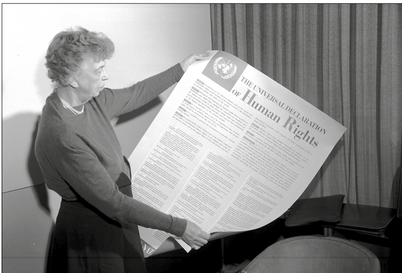
Figure 2: Eleanor Roosevelt, UN commission on Human Rights chair from 1946–52, commemorating the 1948 adoption of the Universal Declaration of Human Rights

Although the Declaration of Alma-Ata faltered in the early 1980s, 19 with governments unable to promote national health systems amid neoliberal economic policies, the unfolding AIDS pandemic would give rise to the modern health and human rights movement. Reacting to societal stigmatisation of marginalised communities, discriminatory criminalisation of key populations, and public health infringements on individual liberty, civil society rose up to demand rights. AIDS activists fiercely challenged policy makers. Rights-based campaigns resounded throughout the world: Silence is Death ; Government has Blood on its Hands ; Fight Back, Fight AIDS . 2