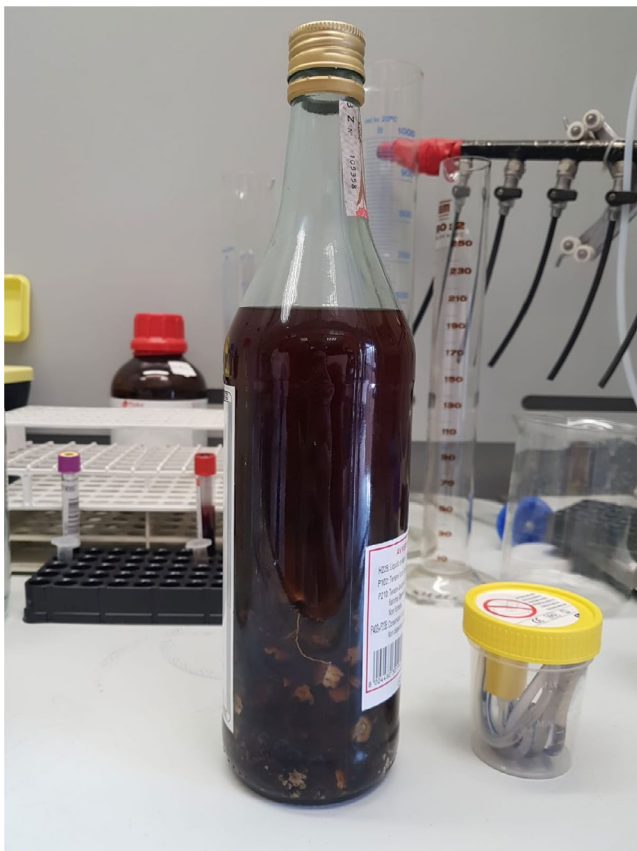
FIGURE 1 Aconitum bottle provided by the relatives

Deeper investigations on patient daily routine were then conducted, in order to identify possible causes underlying this impaired clinical status. Of note, relatives reported the accidental ingestion of a homemade infusion, which was then identified as an Aconitum (Figure 1) preparation that the patient had been using as a topical painkiller. As no antidotes are currently available for aconitum poisoning, supportive and conservative management was performed. Supportive therapy determined fast improvement of patient's clinical condition, without the need of charcoal hemoperfusion, although its use was considered by the intensivists involved in the case. On third day of ICU stay, hemodynamic improvements, restoration of sinus rhythm, and efficient respiratory drive allowed PM removal and extubation, with subsequent referral to cardiology department for further examinations, and then discharge without any other sequelae.