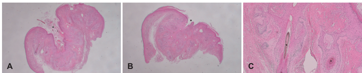
Fig. 2. (A) Keratin-filled, infundibular cyst (asterisk) which is lined by squamous epithelium, is dilated exceedingly with connection to skin surface with abnormal secondary hair follicles radiating from it (hematoxylin and eosin; original magnification \times 10 ). (B) Histologic examination demonstrates primary infundibular cystic structure (asterisk) in connection with the overlying epidermis with secondary, and tertiary follicles emanating from primary follicles (hematoxylin and eosin; original magnification \times 10 ). (C) Higher magnification reveals the cystic structure with the terminal hair shaft (asterisks) (hematoxylin and eosin; original magnification \times 100 ).