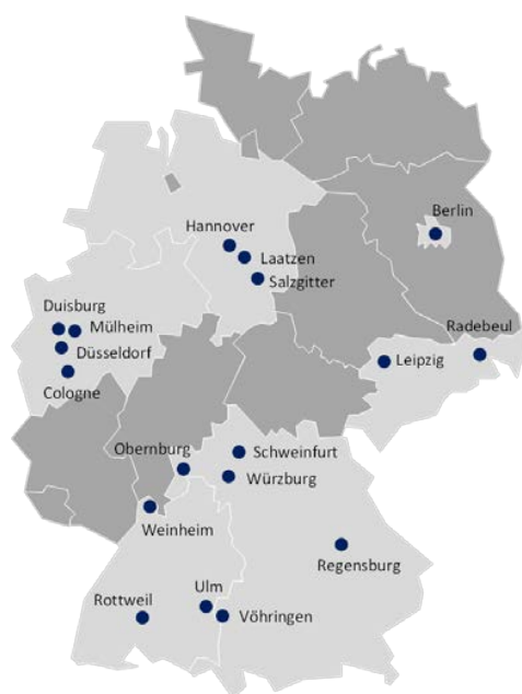
Figure 1. Locations of the participating businesses in 22 cities across Germany.

others, steel and metal manufacturers, the automotive industry, technology ventures, the trade and service industry, and administration and government agencies.