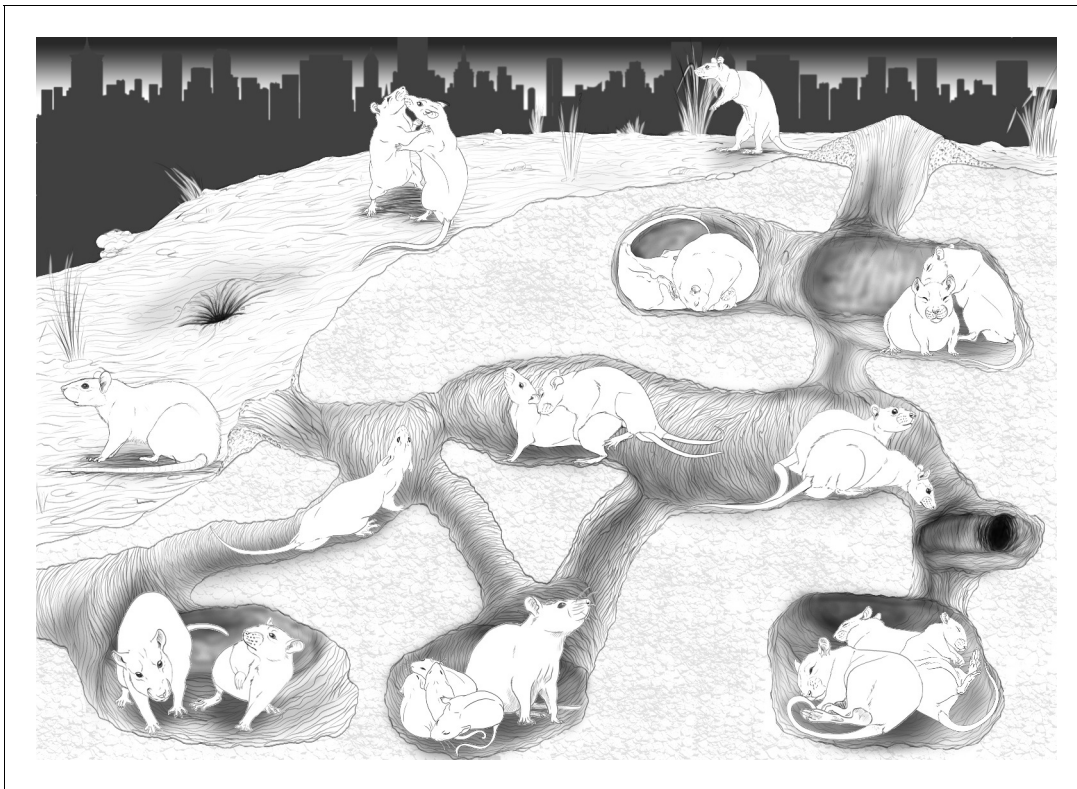
Figure 2. The social organisation of a rat colony. Rats are social animals that live in large colonies, consisting of sometimes more than 150 female and male individuals with overlapping generations. Rats of a colony establish an underground burrow system with shared channels and chambers. In these chambers, they commonly huddle together to keep warm and often sleep like this (right chamber at the bottom and left at the top). Females establish their nest in such chambers, where they give birth to up to eight pups (middle chamber at the bottom). Colony members reproduce. Males approach females that respond defensively with sidekicks, if they are not in oestrus (left chamber at the bottom). If she is receptive, several males will copulate with her (two rats in the middle). Rats establish a dominance hierarchy, which is more pronounced in males than females. When rats meet, they inspect each other, whereby subordinate individuals show a submissive posture, crawl under the other or avoid such contacts to prevent conflict. Most conflicts, however occur between rats of different colonies. Fights typically start with a threat posture, followed by fights that are interrupted by standing upright and boxing (two rats outside the burrow system). Most commonly, however, rats show amicable behaviour with colony members. For example, they spend time in close proximity to each other (left side, middle rats) or groom each other (right chamber at the top). Drawings by Michelle Gyax.

bonds deserves further investigation in order to elucidate their social activities with implications for housing recommendations.