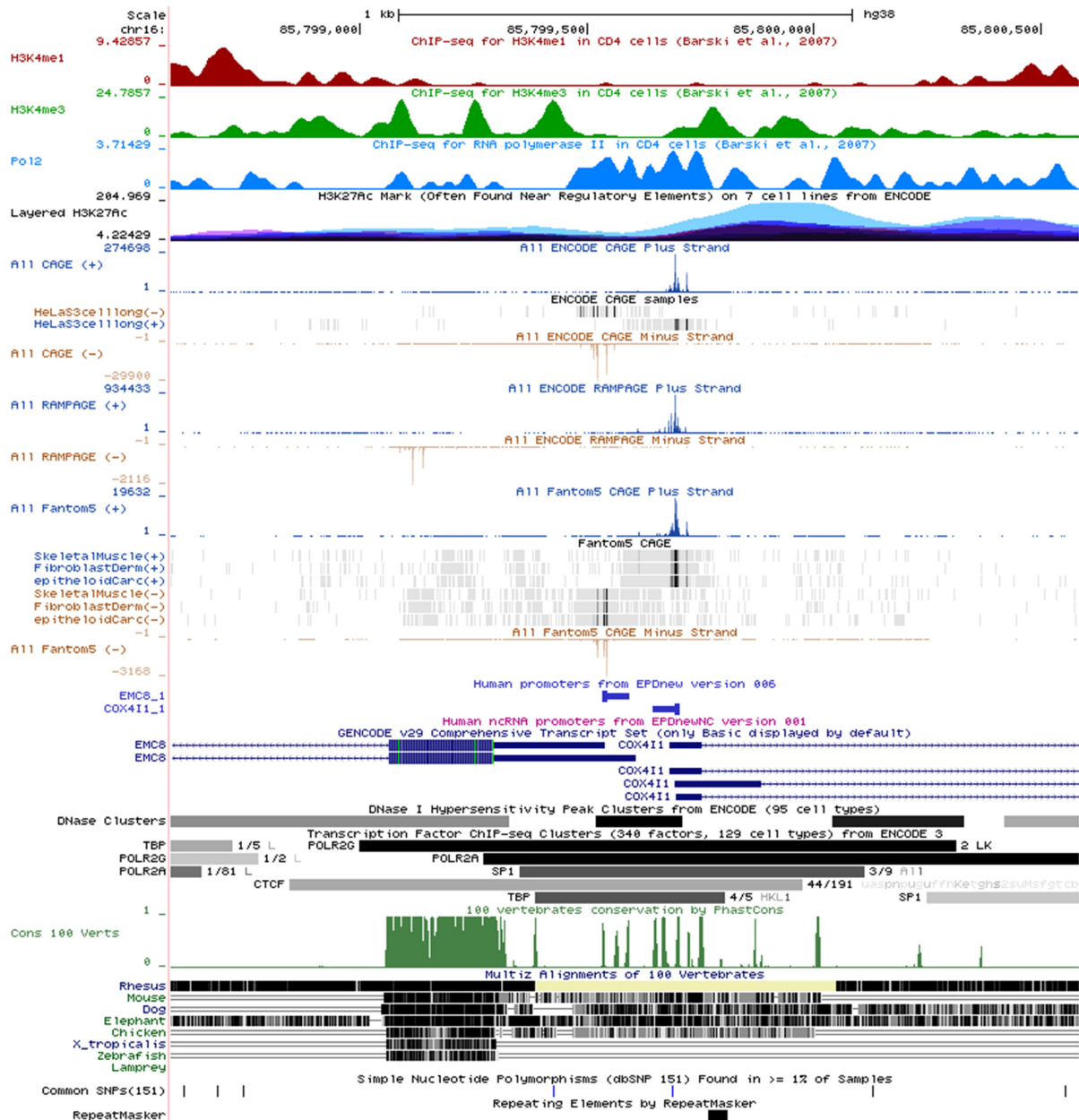
Figure 1. Screenshot of a UCSC Genome Browser window showing two divergent human promoters for genes EMC8 and COX411, as displayed by the EPD viewer. From top to bottom (track source in parentheses): high-resolution ChIP-seq tracks for histone modifications H3K4me1, H3K4me3 and RNA polymerase 2 (EPD); lower resolution ChIP-seq tracks for H3K27ac (ENCODE-UCSC); single base resolution CAGE tracks for ENCODE, RAMPAGE and FANTOM5, all libraries combined plus a few selected tissue-specific libraries (EPD); EPD promoter annotation track, thin and thick lines mark 50 bp upstream and 10 bp downstream regions relative to the dominant TSS (EPD); GENCODE genes (UCSC); open chromatin/DNase I clusters (ENCODE-UCSC); ChIP-seq peaks for selected transcription factors and RNA polymerase 2 subunits (ENCODE-UCSC); sequence conservation tracks, common SNPs from dbSNP and repetitive elements from RepeatMasker (UCSC).

database, the EPD track hub or public track hubs registered at UCSC. Currently, all EPD-provided track sets are represented by at least one track, thereby enabling users to rapidly find and load additional tracks from the same set by right-clicking on the track set name displayed on the left-hand side of the browser window.