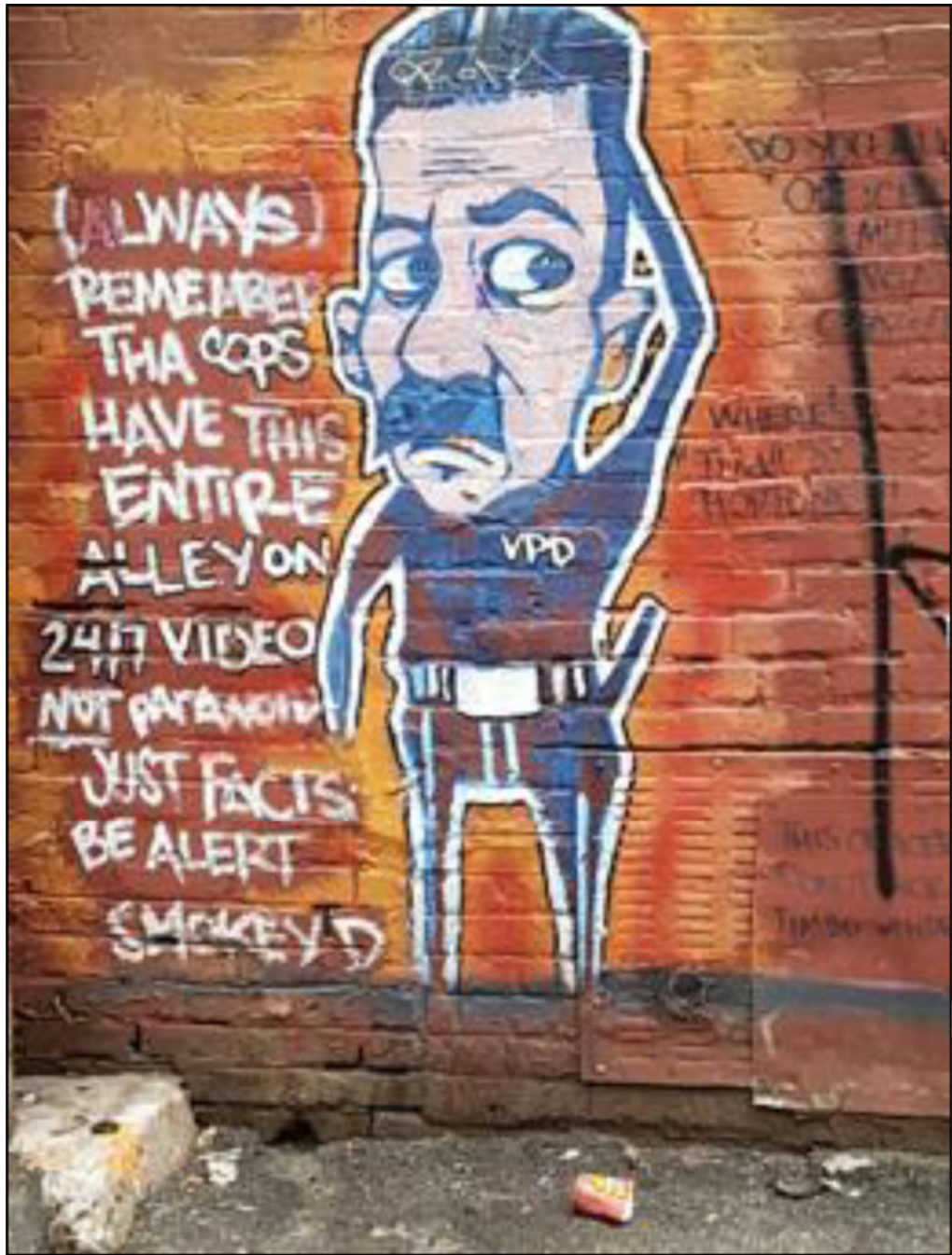
Figure 2. Graffiti of policing in the alley behind the Street Market