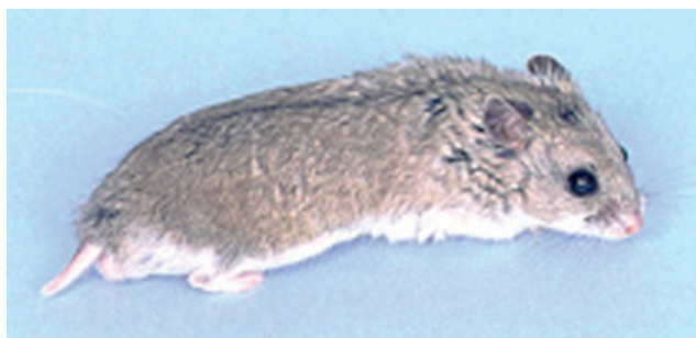
FIGURE 35.1 An adult Chinese hamster, Cricetulus griseus . Note the dark stripe on the dorsal midline.

contributions as a laboratory animal have been largely overshadowed by the focus on its cell lines and the role they play in scientific research and biotechnology.