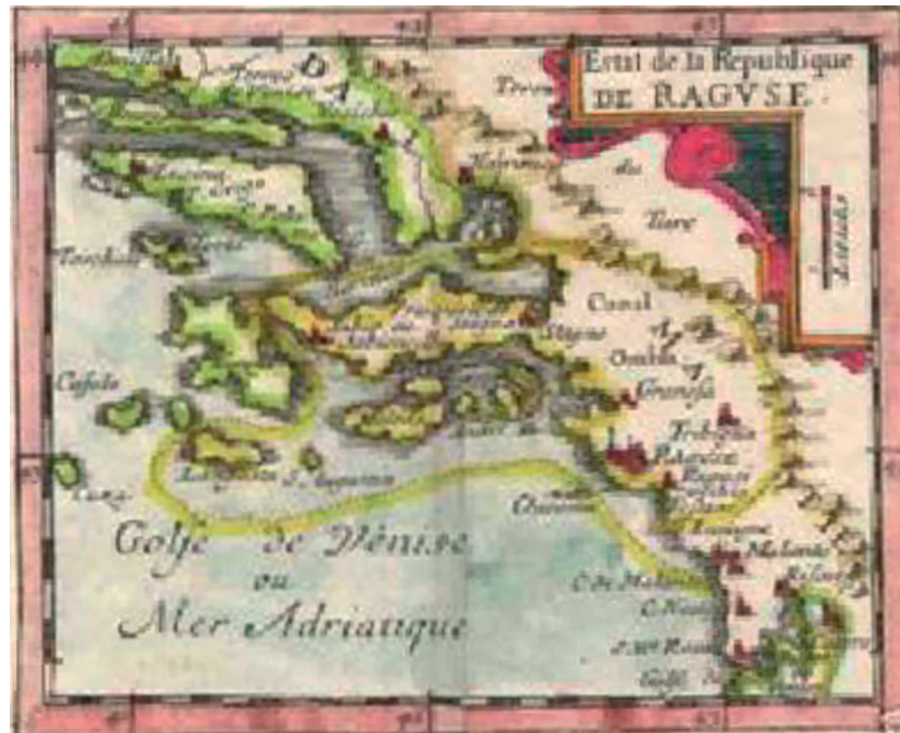
Figure 2 The Republic of Ragusa.