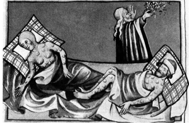
Figure 1 Illustration of the “Black Death” from the Toggenburg Bible (1411).

In 1348, during a notorious epidemic of the plague (the “Black Death” described by the Italian writer Giovanni Boccaccio in his masterpiece Il Decamerone ) the Republic of Venice (Italy) established a system of quarantine assigning to a council of three the responsibility and power of detaining individuals and entire ships in the Venetian lagoon for 40 days (Figure 1).