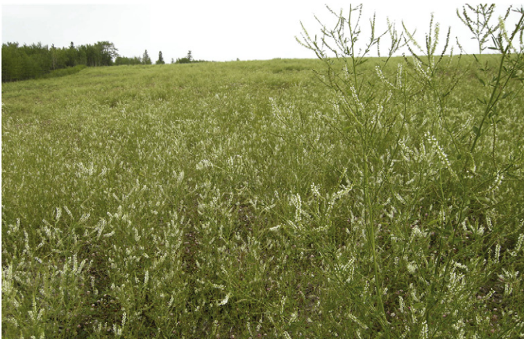
Figure 2.3 A general view of the site where sweet clover plants were grown to prevent soil erosion. This site was used to observe the natural spread of SCNMV.

Regular visual inspections and samplings were conducted, and followed by infectivity tests on the indicator plants in the greenhouse. The results indicated that SCNMV infection occurred at a rate of about 6%. The source of the natural infection remains unknown. In the past, the natural infection of a solitary sweet clover plant in the forest, roadside, or riverbanks was observed frequently and shown to test positive (C. Hiruki, unpublished data). When infected sweet clover is not disturbed, abundant seeds are shed around the plant, and the young seedlings are subsequently infected by the soil transmission of SCNMV.