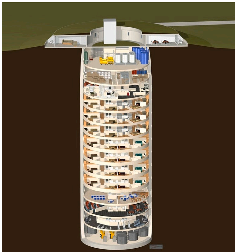
Fig. 2. A cross-section render of the converted Atlas F Silo.

This infolding of prepping practices into everyday life has also been concurrent with the aging of infrastructural systems, the privatisation of public services, and cuts to social ‘safety nets’ under neoliberal ideologies in much of the western world (Garrett et al., 2020). Much prepping, unlike survivalism, is not based on conspiracy but experience, and there is a ‘distinct difference between such fringe elements of the past and the average prepper of today’ (Huddleston, 2016: 241). As Mills writes, contemporary preppers include a wider demographic spectrum of society, and many preppers are not prepping for an apocalyptic event, they are simply interested in securing ‘nutrition, hydration, shelter, security,