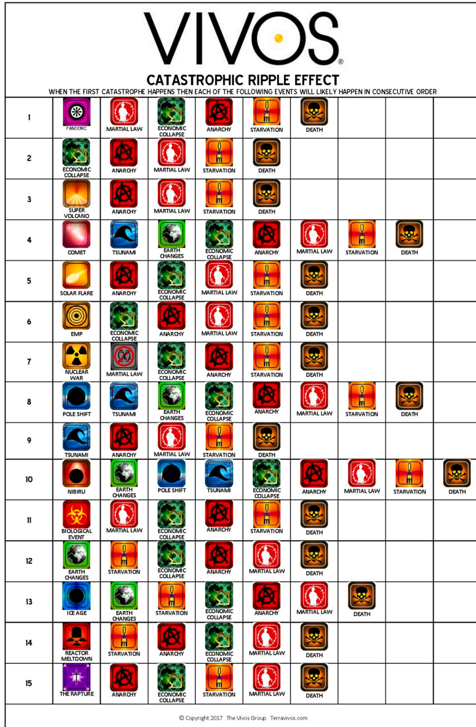
Fig. 3. The catastrophic ripple effect.

What Freud is suggesting here, in a passage that almost sounds like it was written about preppers – and society’s response to them – is that it makes far more sense to see the ‘neurotic’ or delirious individual as a person rationally responding to an uncertain situation. Their tendency to ‘ascribe a dreadful meaning to events’ may be triggered external situations as much as internal psychological makeup. These feelings are