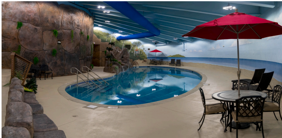
Fig. 4. The pool inside the Survival Condo.

They had a beer keg system and one of the residents had provided 2600 bottles of wine from her restaurant to stock the wine rack. As he showed me this, Hall insisted that recreation, sharing, and community amongst the residents was as important to the facility's design and management as the technical systems.