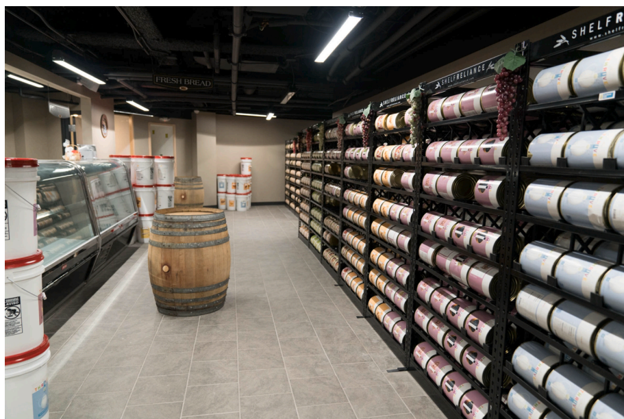
Fig. 5. The ‘General Store’ in the Survival Condo.

The bunkers being built by preppers might reflect atomisation but they are not a terminal architecture, they are a social prism through which to understand dialectical hope in dread. As sociologist Richard J. Mitchell writes in his study of late 20th-century survivalists, they were ‘not just a consequence, a dependent variable, a result of the conditions of contemporary social life, but... an indicator, a lens for perceiving and understanding those conditions’ (Mitchell, 2002: 146). Equally, by expanding optics on the materiality of the bunker to give serious consideration to the social forces behind contemporary underground construction, and the completely rational retreat into them during the