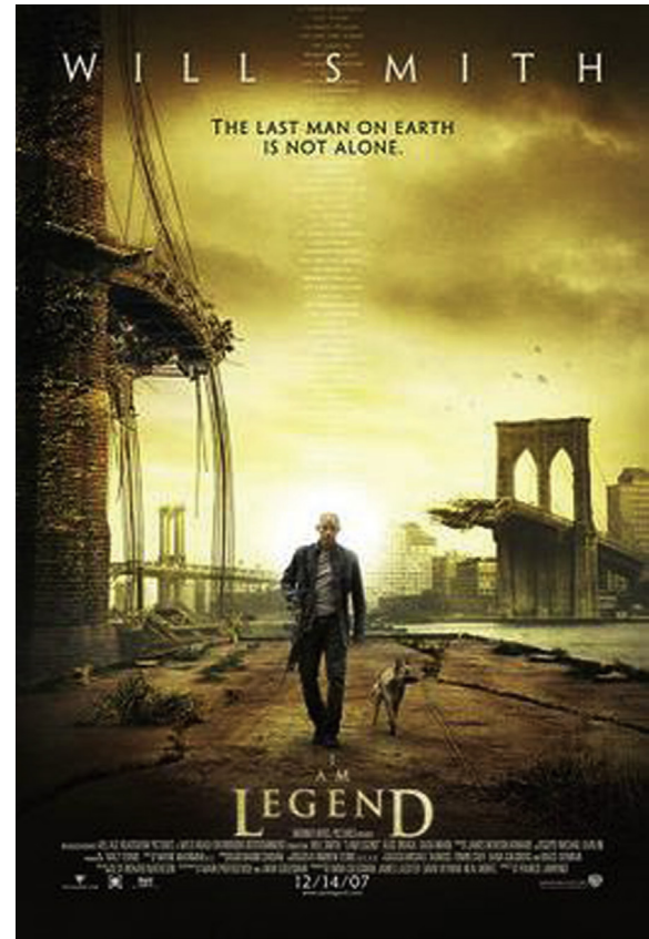
FIG. 5.5 I Am Legend movie teaser poster. (Reprinted with permission by source, fair use: https://en.wikipedia.org/w/index.php?curid=11659226 .)

Rabies even shows up in our comedy with appearances in shows like King of the Hill and Beavis and Butt-Head , as well as in an episode of The Office . In the popular Seinfeld episode—classic TV—one of the main characters, Elaine, gets bitten by a dog, the owner evades her, she has to get PEP (the doctor tells her the shot will hurt very much), and she keeps thinking she is showing signs of rabies (spitting back water, frothing at the mouth, etc.). 1 It seems that rabies will always have a place in shaping pop culture, especially in the realm of the horror and science fiction genre. One can assume that because of this ongoing fascination with rabies in the arts and in our passing on of stories, often handing them down from one generation to the next, that we will continue to be fed misconceptions (although often based on science) about this diabolical virus known as rabies.