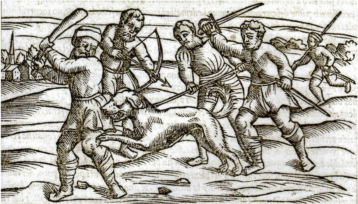
FIG. 5.1 A woodcut from the middle ages showing a rabid dog.

As a side note, one should always consider the risk of infectious disease when traveling to other countries by discussing travel plans with an appropriate person such as a travel physician or other health-care professional. There may be a need to plan for preexposure vaccinations (e.g., rabies, yellow fever, etc.) or medications (e.g., malaria, antibiotics) to take on their travels. 16