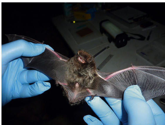
FIG. 5.6 A silver-haired bat, the type that has been responsible for numerous human rabies cases and deaths.

L. noctivagans , compared with Myotis lucifugus and Eptesicus fuscus , suggests the discrepancy of human rabies cases may be due to increased infectivity in heterospecific hosts, human susceptibility, and/or behavioral factors. 33 In the interim, misconceived notions will most likely continue to be generated regarding the prevalence, signs and symptoms, diagnosis, and treatment protocols pertaining to this notorious and ancient killer known as rabies. It is incumbent upon all of us to be better stewards in the art of science communication with respect to decreasing the misunderstanding and sometimes panic surrounding this ancient disease.