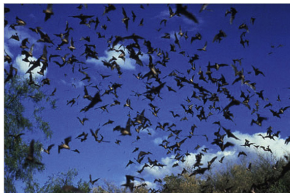
FIG. 5.2 Flying bats: this horde of flying bats could contain possible carriers of the rabies virus. (Reprinted with permission by source, fair use: Centers for Disease Control and Prevention (Public Health Image Library).)