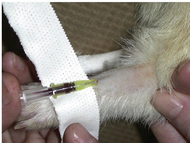
Fig. 2-4 Placing an indwelling catheter in the cephalic vein of a ferret. The hair over the vein is shaved and the vein held off. A 24-gauge, three-quarter-inch intravenous catheter is introduced into the cephalic vein and taped in place.