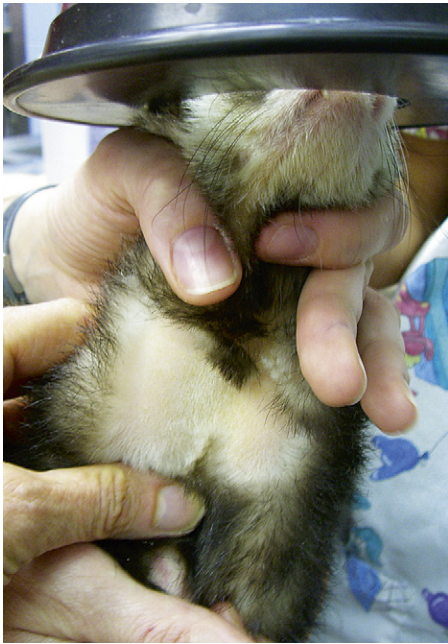
Fig. 2-2 Restraint for jugular venipuncture in a ferret. Restrain the ferret similar to a cat, with the legs pulled down and the head back. Shave the neck to improve visibility of the jugular vein in the lateral neck. After the vein is punctured, the head can be “pumped” up and down slowly to facilitate blood flow.

venipuncture in most ferrets; a 22-gauge needle can be used in large males. Shave the neck at the venipuncture site to enhance visibility of the jugular vein. The vein is relatively superficial and is located more lateral in the neck than it is in dogs or cats, and it is sometimes difficult to locate in heavy males. Once the needle is inserted, the blood should flow easily into the syringe; if the neck is overextended and the head is arched back, the blood may not flow readily from the vein. Relax the hold on the head or gently “pump” the vein by moving the head slowly up and down to enhance blood flow into the syringe. With ferrets that resist limb extension, a towel-wrap technique can be used. 9 Scruff the ferret with its front legs extended caudally against the ventral thorax, and wrap the animal’s body firmly with a towel from the base of the neck down. An assistant is needed to restrain the towed ferret in dorsal recumbency while scruffing the cranial neck. Apply pressure lateral to the thoracic inlet to visualize or palpate the jugular vein lying between the thoracic inlet and the base of the ear. However, with very fractious animals, even this technique may be difficult without tranquilization.