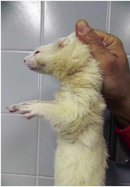
Fig. 2-1 Restrain an active ferret by scruffing the loose skin on the back of the neck. The ferret will relax and allow you to palpate the abdomen or administer a vaccine.

Company, Dayton, OH) or a small amount of a supplement such as FerreTone (8-in-1 Pet Products, Islandia, NY) by syringe. Avoid products containing sugar, which can affect blood glucose values, particularly in ferrets with insulinoma.