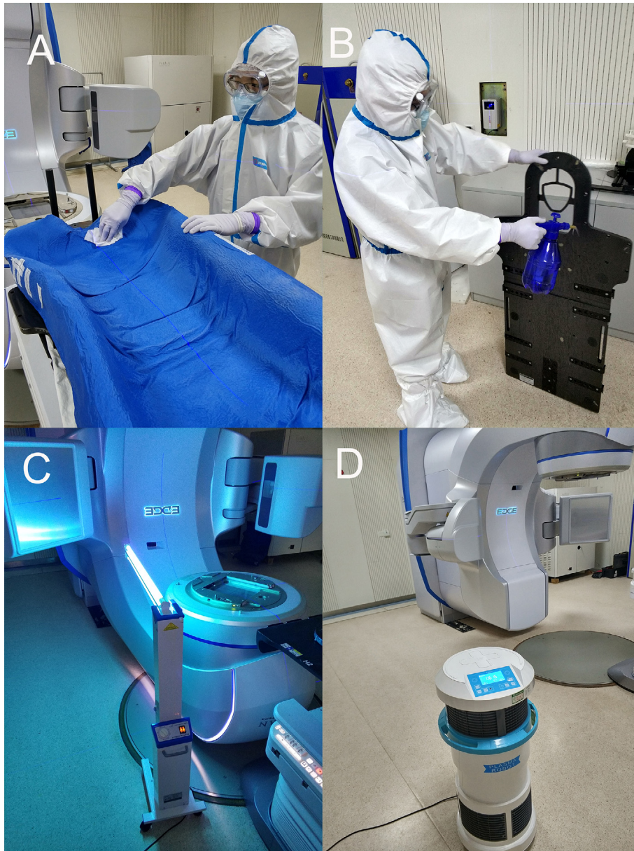
Fig. 4. Example of specific area disinfection procedures. (A) A Vac-Lok bag was wiped down with ethanol. (B) A treatment table extension was cleaned with ethanol spray. (C) A LINAC was disinfected with UV lights. (D) Air disinfection was performed with an air sanitizer.

were applied in a sequential fashion: top to bottom, left to right, inside to outside, and surface to space. The areas were then fully ventilated after the disinfection was complete (the time of action of hydrogen peroxide and chlorine dioxide is 30–60 min, and that of peroxyacetic acid is 1 hour). Air sanitization equipment was used for disinfecting large capital equipment in the treatment vaults due to a possible erosive effect of disinfecting sprays (Fig. 4D).