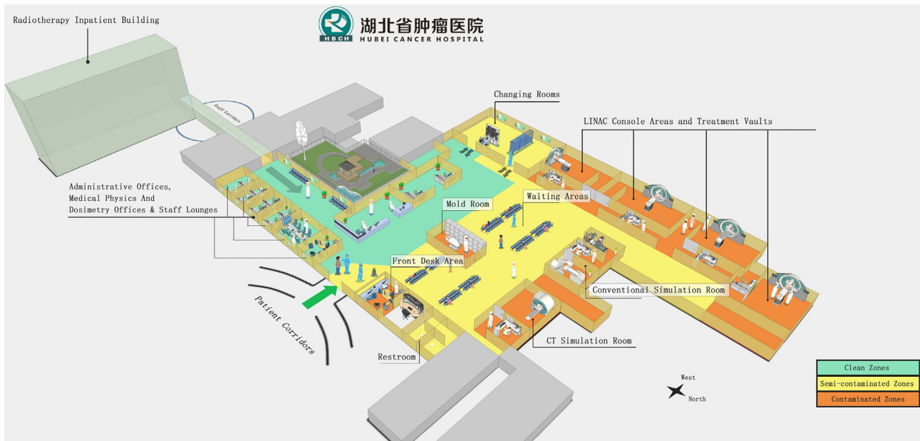
Fig. 1. Radiotherapy center layout and infection control zoning.

to be quarantined immediately and would not return to work until an infection was ruled out.