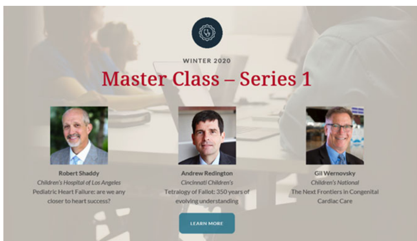
Figure 5. The Master Class Series.