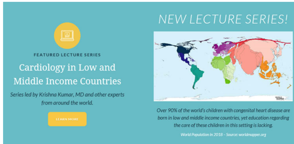
Figure 7. Cardiology in Low- and Middle-Income Countries Lecture Series.