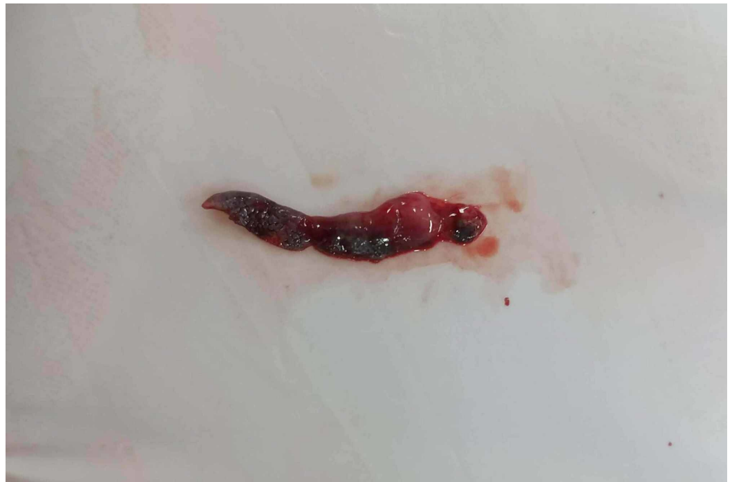
FIGURE 2: Gross biopsied specimen

The pigmented area was smooth, non-tender with irregular margins involving free and attached gingiva. The patient denied any cutaneous pigmentary changes, foods, or dental hygiene agents that had caused any oral irritation, usage of tobacco products, and awareness of oral habits of compulsion. The widespread nature and clinical appearance of the lesion were perplexing for the authors, thereby necessitating an incisional biopsy. The area to be biopsied was the edentulous region (46). The gross specimen comprised an irregular, blackish-brown soft tissue measuring 1.5 x 0.6 x 0.2 cm in size (Figure 2).