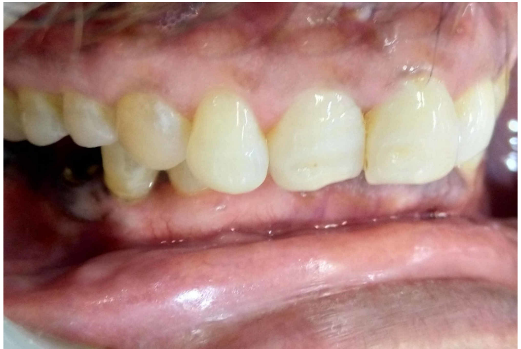
FIGURE 5: Postoperative view