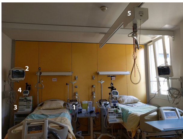
Fig. 2. Picture of a double room fully equipped for ventilator-dependent patients within the rehabilitation department. 1: level-3 life support ventilator; 2: non-invasive continuous monitoring; 3: flow meters for perfusion; 4: nutrition pump for enteral feeding; 5: lift and harness for bed-to-chair transfers.

The goal of the specific organisation we describe is to allow for early patient discharge from the ICU and increase ICU admission capacity over time during the COVID-19 crisis. It also allows for a physical medicine and rehabilitation holistic evaluation of post-critical COVID-19 patients. Hence, our first feedback strengthens the idea that our unit constitutes a possible intermediary stage between ICU and either home discharge or inward rehabilitation for patients with pulmonary, nutritional, neurological and psychological COVID-19-related and/or post-ICU impairments.