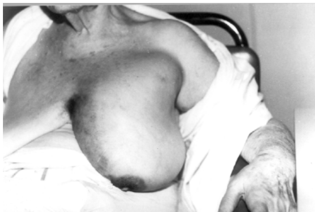
Figure 1. The left breast was swollen and showed a prominence with a central depression in the axillary region. A purple-blue discoloration was evident in the depending regions of the breast.

diffusely hypoechoic mammary gland, and a tentative diagnosis of breast hematoma was made. The onset of a purple-blue discoloration of the depending regions of the breast 12 hours after admission later confirmed this (Figure 1). It is likely that the repeated microtrauma caused by the pad of the walker on the axillary lobule of the breast, corresponding to the observed skin depression, caused the hemorrhage.