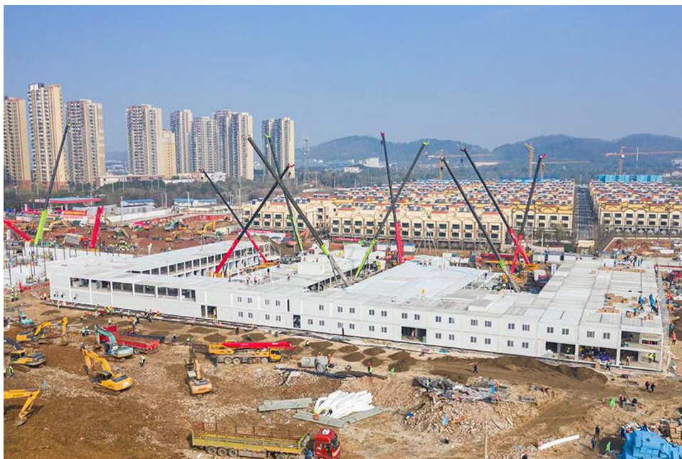
FIGURE 2 Huoshenshan Hospital takes shape in Wuhan, Hubei province, on 30th January, 2020 25

Meanwhile, there have been growing concerns that health facilities in Wuhan city were severely overstretched. Specific mentions were made of beds running out, as well as test kits and basic protective equipment. In response to the crisis, the city officials announced the ongoing construction of two designated makeshift infirmaries to deal with the expected upsurge in cases. Both hospitals, named Huoshenshan and Leishenshan: meaning "Fire God Mountain" and "Thunder God Mountain respectively," are said to be able to accommodate 2500 beds collectively, after their completion on 5th February. 24 An image of the current state of the Huoshenshan Hospital is shown in Figure 2. 25