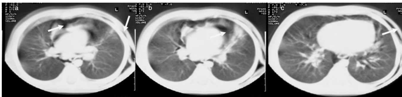
Fig. 2 (a) Spontaneous pneumomediastinum, (b) subcutaneous emphysema and (c) bilateral paracardiac infiltration were seen more easily on thorax computed tomography.

The frequency of HBoV infection among children with influenza-like symptoms is 10–33%. 4 The prevalence of HBoV DNA in the respiratory specimens of patients with acute respiratory diseases was 6.5% in children and 2.5% in adults in Turkey. 5