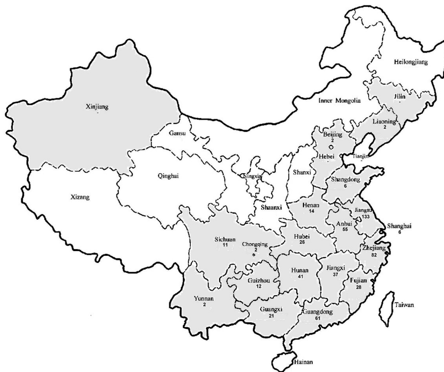
Figure 2 Geographic distribution of the fifth wave of human infection with avian influenza A(H7N9) in Mainland China. 29 Cases include those reported from October 2016 to 25 March 2017. Two cases in Beijing were imported from Hebei and Liaoning. Two cases in Yunnan Province were imported from Jiangxi.

and thrombocytopenia. Elevated cytokine levels have been observed in patients and the excessive cytokine responses may contribute to the clinical severity of A(H7N9) infection. 35,36