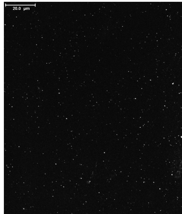
Fig. 2. Fluorescence microscopy of VLPs in the bushmeat sample no STE0014. All images were acquired with a Leica SP5 inverted confocal microscope with four lasers, a 100 \times objective and a numerical aperture of 1.4. The scale bar represents 20 \mu m.

The DNA and RNA viromes of sample STE0011 were sequenced with Illumina MiSeq technology. After trimming,