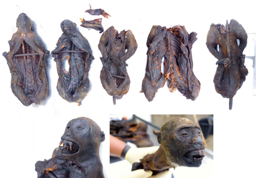
Fig. 1. Primate bushmeat specimens seized at the Toulouse Blagnac Airport. [Colour figure can be viewed at wileyonlinelibrary.com ]

Samples were taken from the axillary and popliteal regions, containing lymph nodes and muscle tissues. The