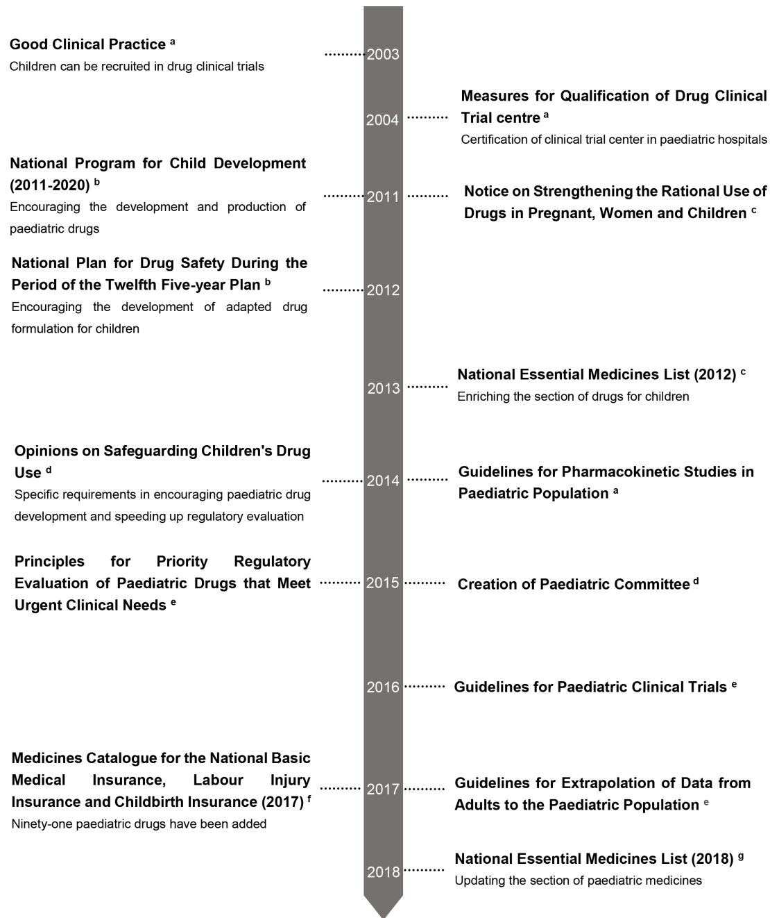
Figure 2 Policies on paediatric drug trials in China. (a) State Food and Drug Administration, SFDA (now namely National Medical Products Administration, NMPA); (b) The State Council; (c) Ministry of Health (now namely National Health Commission); (d) National Health and Family Planning Commission, NHFPC (now namely National Health Commission); (e) China Food and Drug Administration, CFDA (now namely NMPA); (f) Ministry of Human Resources and Social Security; (g) National Health Commission.