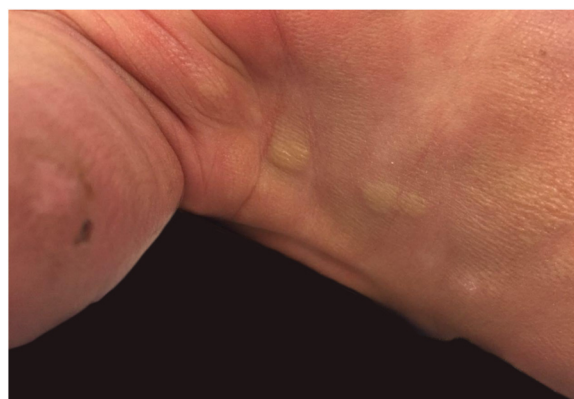
Figure 2 Erythematous brownish plaques on lower limb, topped by blisters at different stages of development (stray blisters, flaccid blisters and exulcerations).