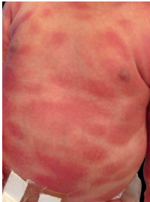
Figure 1 Erythematous plaques present at birth.

At that moment, prednisone 1 mg/kg/day was introduced and a skin biopsy performed. The skin biopsy revealed numerous of diffuse mast cells cutaneous infiltrates stained in metachromically toluidine blue staining, confirming the diagnosis of mastocytosis (Fig. 3). Immunohistochemistry CD117 (c-kit) evidenced massive positivity of mast cells