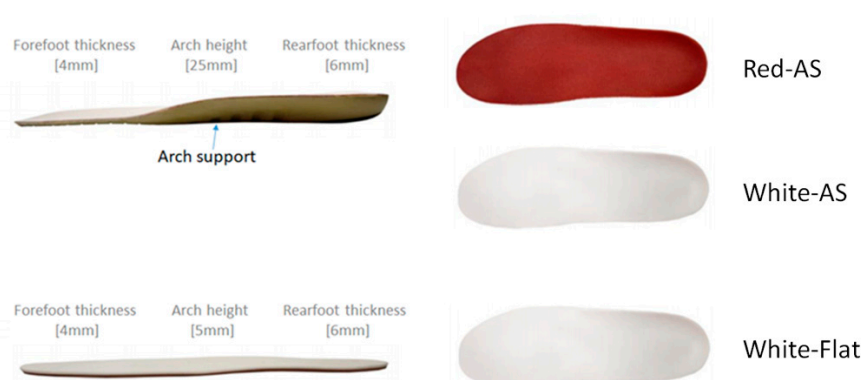
Figure 1. The thickness across forefoot, midfoot and rearfoot regions in each of three insole conditions (red arch-support (Red-AS), white arch-support (White-AS), white control (White-flat)).