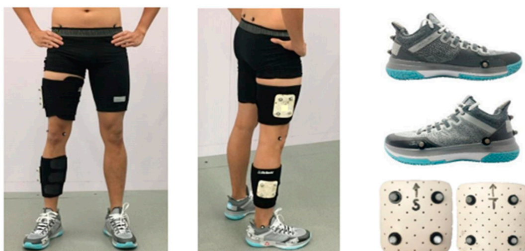
Figure 2. Reflective marker placements.

The participants were asked to tighten their laces based on their individual preferences for basketball games. Prior to the actual testing, participants were reminded of the insole types in each orthosis condition, as it would encourage participants to be maximally aware of the functional benefits of the foot orthoses (color and contour) that led to the actual changes in performance [27,28,47].